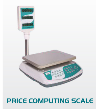
TABLE TOP SCALES